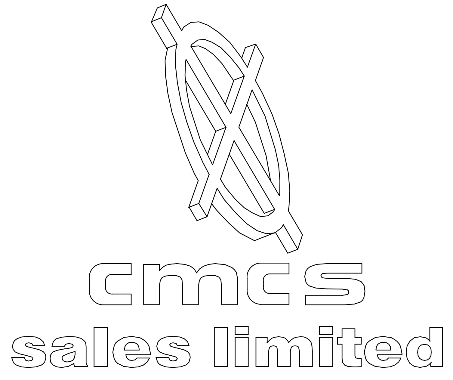
DIAGRAM REMAINS THE PROPERTY OF CMCS SALES LIMITED NOT TO BE DISCLOSED TO THIRD PARTIES WITHOUT PRIOR WRITTEN PERMISSION.